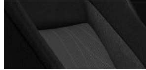
Prius c L and LE Gray/Black two-tone fabric