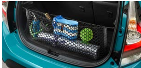
Cargo net — envelope