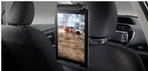
Universal tablet holder 3

Paint protection film 37 Universal tablet holder 3