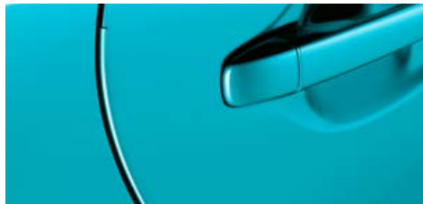
Door edge guards