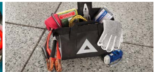
Emergency assistance kit