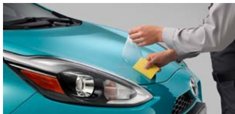
Paint protection film 37