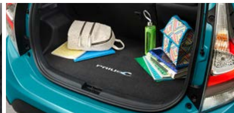
Carpet cargo mat