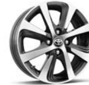
15-in. 8-spoke machined alloy wheels with dark-gray-painted accents