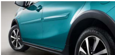
Body side moldings