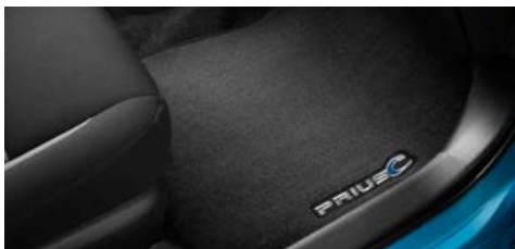
Carpet floor mats 36