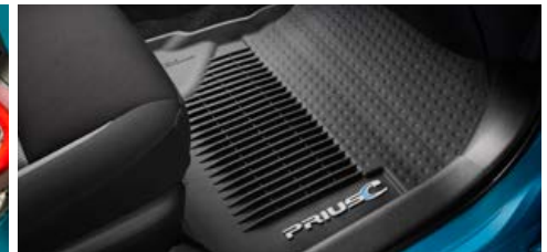
All-weather floor liners 36