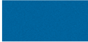
Blue Streak Metallic