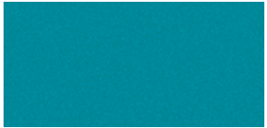
Tide Pool Pearl 35