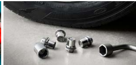
Alloy wheel locks